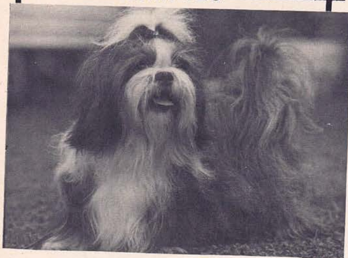
Aust Ch KATHIAWAR CHIU CHENG