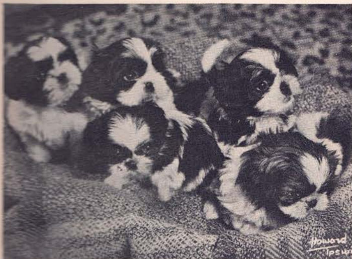
SHIH TZU PUPPIES are attractive bundles of fur and photographs of their young stock are often used as advertising by breeders. These puppies were bred by Miss Bennett of Ipswich, England.

grooming as an attractively presented face can do so much for your dog. In the baby there is very little space in which to work and you must be so careful not to damage the eyes. The brush you use for the body is possibly too big at this stage so use an old tooth brush with nice soft bristles. Put some baby powder in an open container, dip the tooth brush in this and gently brush the whiskers in layers (away from the eyes) as you have done for the body coat. Finish off by