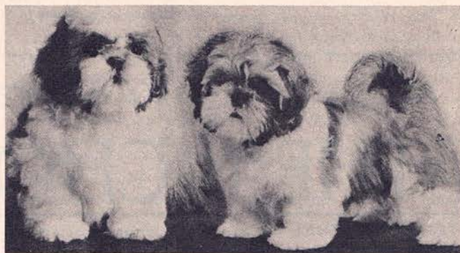
Miss E M Evans, well-known English breeder, bred these attractive six-week old puppies