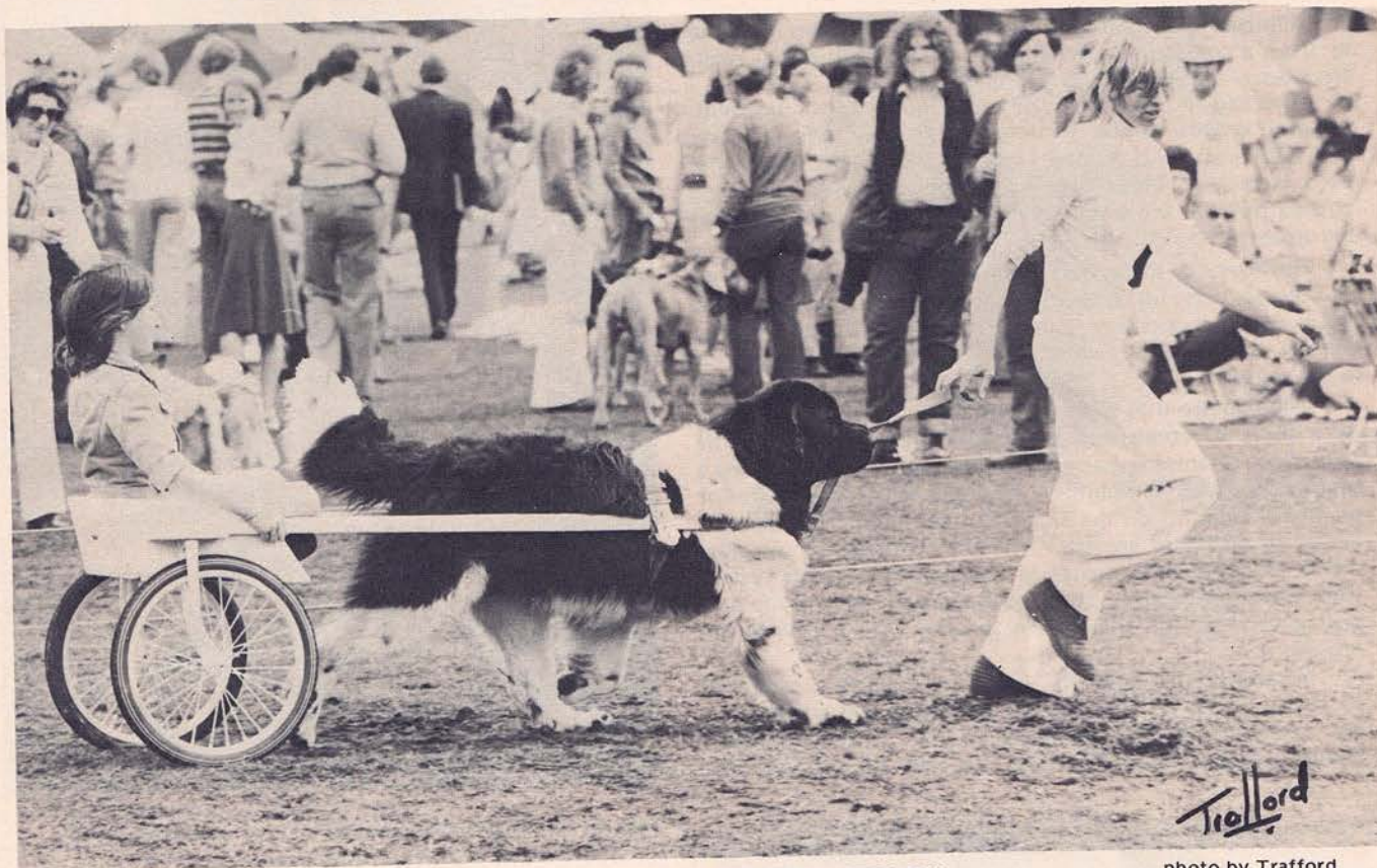
CH PLANHAVEN PRESTO TEDDY