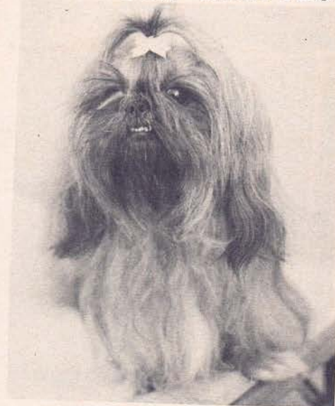
RIMPOCH MOO TING

SMALL KENNEL — PERSONAL ATTENTION Enquiries on Puppies & Stud welcome