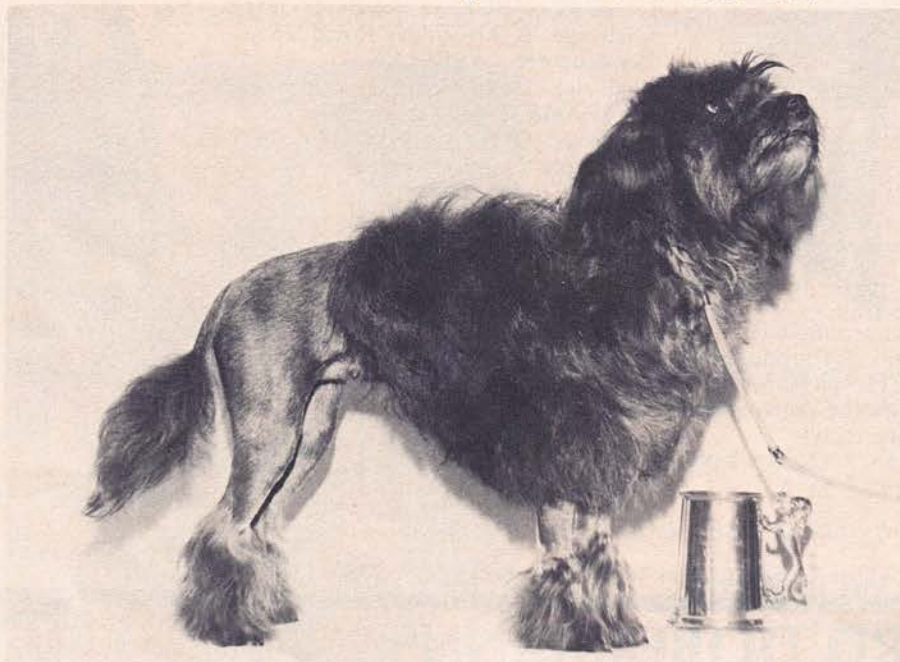
JILLAND DOUBLE DELIGHT

We have combined Quality and Temperament in our three selected imports to promote this FABULOUS BREED